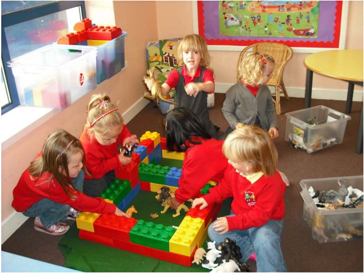
Lisbellaw Community Nursery School October 2009