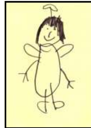
'Angel' by Jiraporn Magee